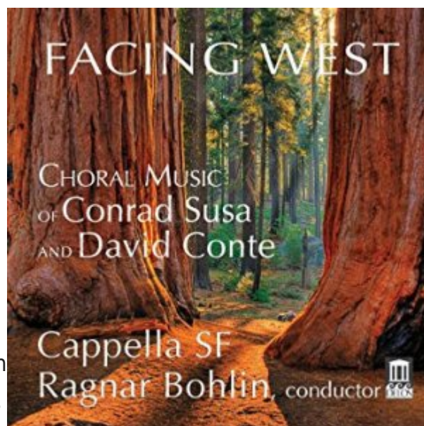
Cappella SF: "Facing West"

In June 2010 he made his Carnegie Hall debut conducting Brahms' Ein deutsches Requiem. Since 2011 he has appeared several times as guest conductor of the São Paulo Symphony Orchestra and Chorus.